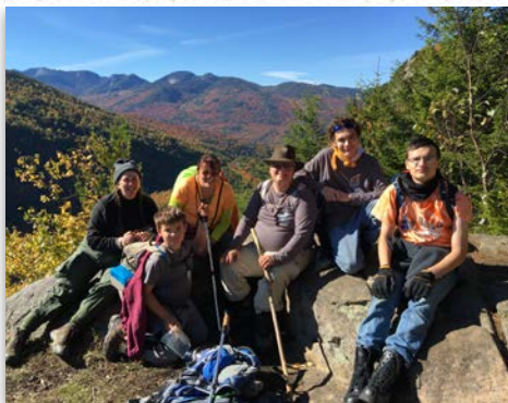
Troop 334 hiking up Giant Mountain during the 2015 Massawepie Adirondack Challenge.