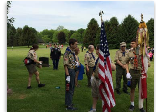
Serving as Honor Guard on Memorial Day

Serving Rush & Henrietta for over 48 Years Proud to be chartered by the Stevens-Connor American Legion Post #1330