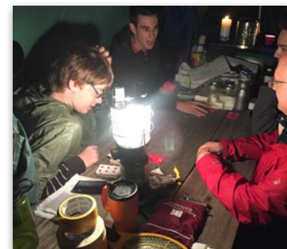
Games and stories, and even some fly tying, after a fun day at Camp Massawepie