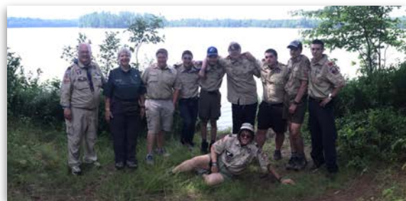
By the shore of beautiful Massawepie Lake

We have a year-long activities program that includes camping, hiking, field trips and community service projects.