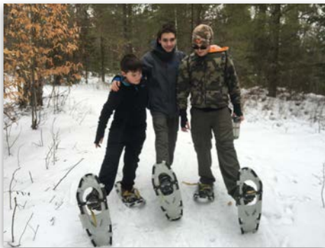
Snowshoeing in the Adirondacks

Archery Indian Lore Architecture Journalism Astronomy Kayaking Auto Maintenance Law Aviation Lifesaving Backpacking Moviemaking Camping Music Canoeing Nuclear Science Chemistry Photography Citizenship Programming Climbing Radio Composite Materials Rifle Shooting Computers Search and Rescue Engineering Shotgun Shooting First Aid Snow Sports Fishing Space Exploration Fly Fishing SCUBA Game Design Swimming Geocaching Veterinary Medicine Geology Welding Horsemanship Wilderness Survival